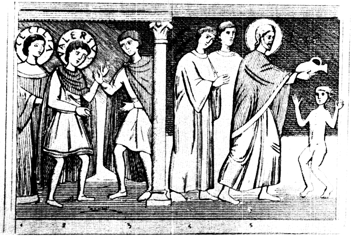
Fresco. Church of St. Urban. Rome. Cecilia, Valerian, Tiburtius. Baptism of Tiburtius.