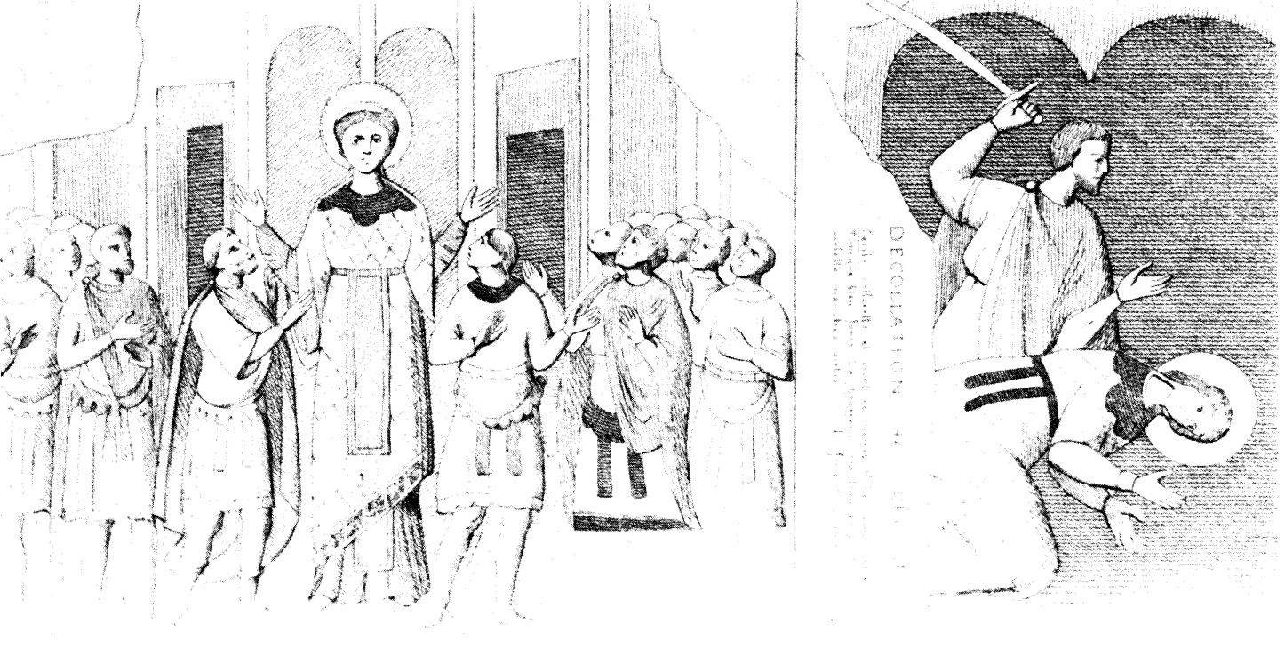
Painting. Basilica of St. Cecilia, Rome. Cecilia preaches to her guards. The beheading of Cecilia.